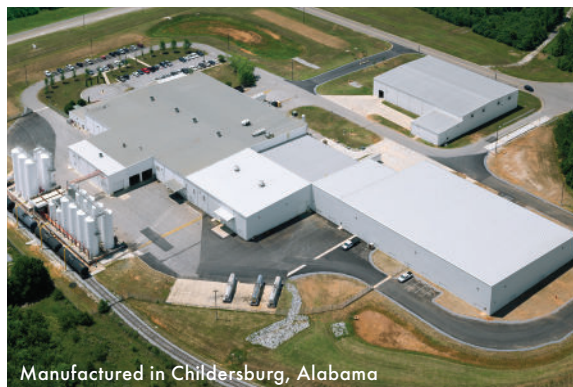
Manufactured in Childersburg, Alabama

JX NIPPON OIL & ENERGY is the leading innovator and supplier of automotive lubricants to the majority of Asian automobile manufacturers.