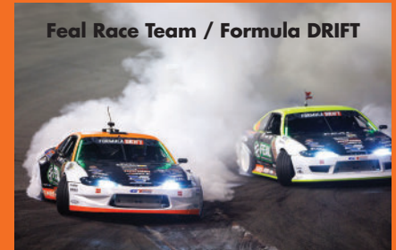
Feel Race Team / Formula DRIFT