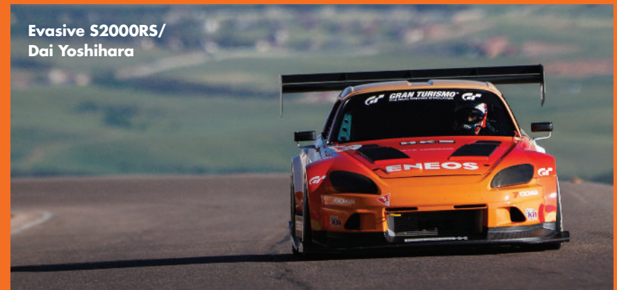
Evasive S2000RS/ Dai Yoshihara