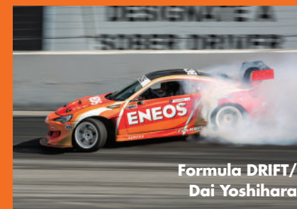
Formula DRIFT/ Dai Yoshihara

Through our ongoing motorsports involvement, ENEOS has been able to apply lessons learned on the track to improve our formulations for passenger vehicles in terms of power and protection at high temperatures and high RPM. We have developed the ENEOS RACING Series oils for amateur and professional racing drivers to provide cold-start protection and extended high-temperature running while helping to increase power with low-friction formulations.