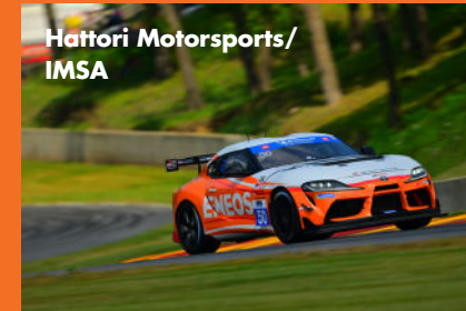
Hattori Motorsports/ IMSA